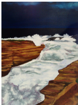
Seascape Stuart Fletcher