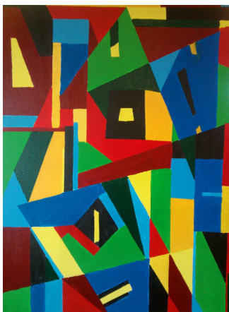
Carnavale Glenn Little